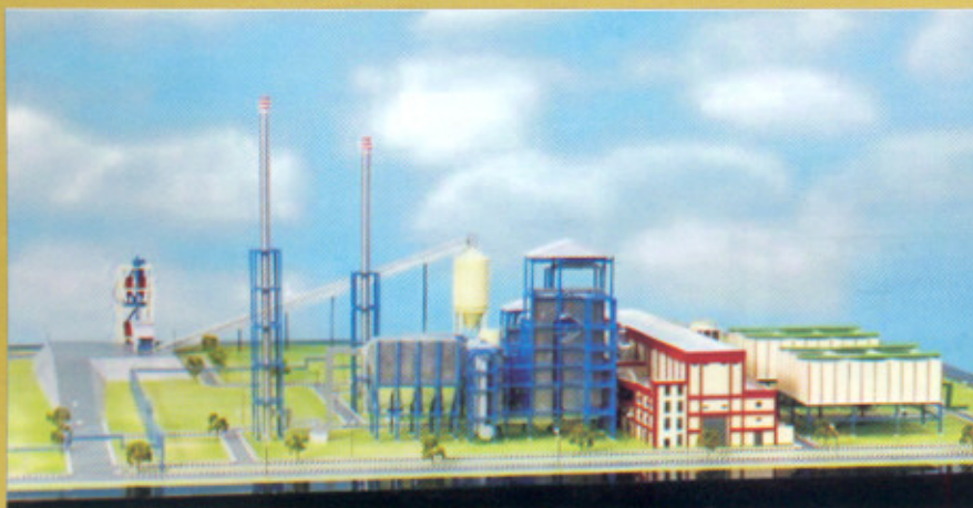
Typical layout of Captive Thermal Power plant

HOLTEC has executed Consulting assignments in over 67 countries. With