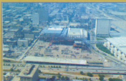
Structural Steel Detailing and Design Convention Centre at Chicago

tions with a variety of International companies in order to source global business and share best consulting practices.